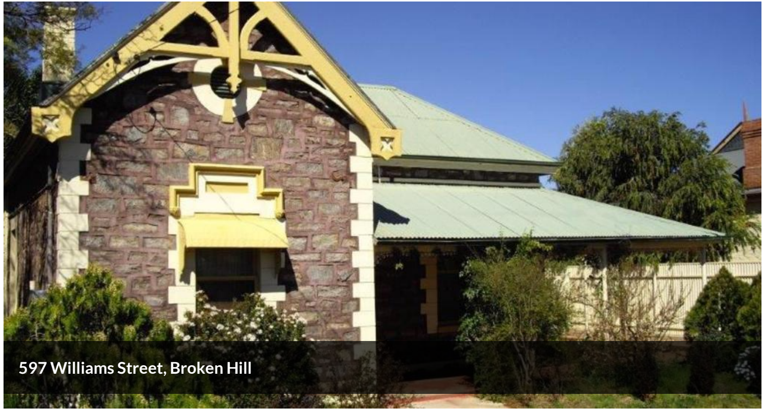
597 Williams Street, Broken Hill