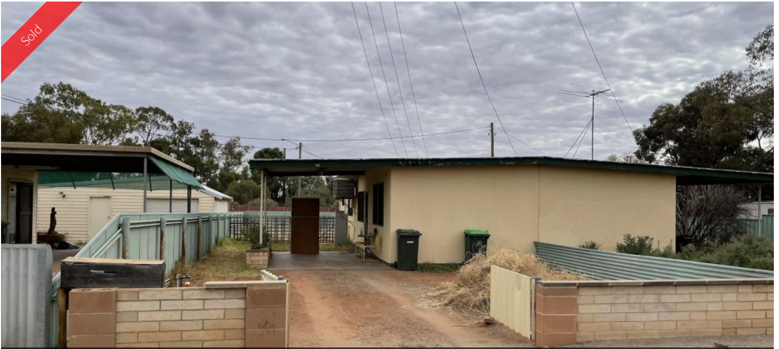
616-618 Beryl Street, Broken Hill