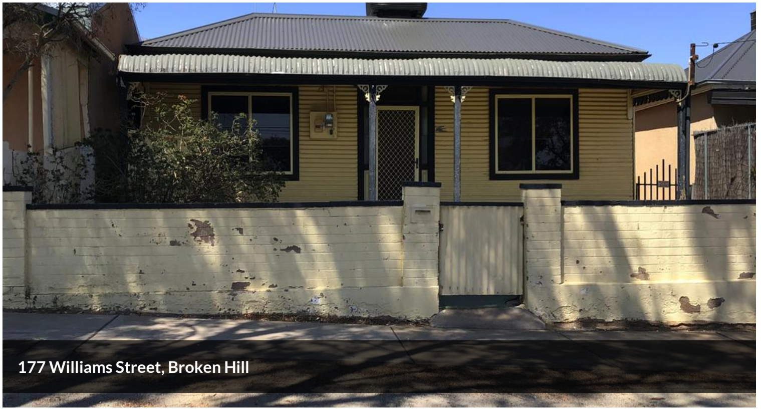
177 Williams Street, Broken Hill