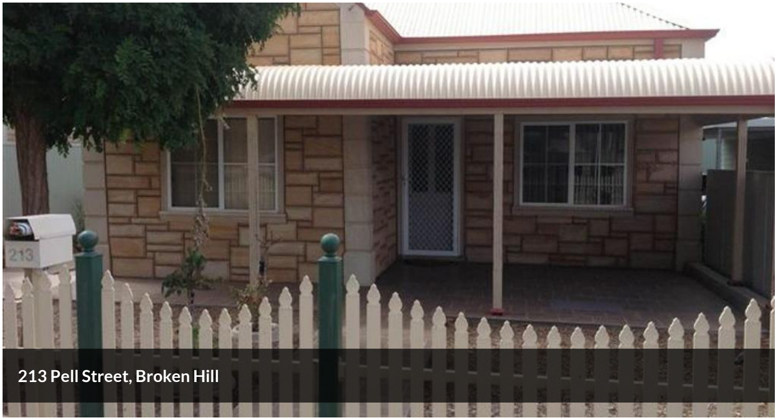
213 Pell Street, Broken Hill