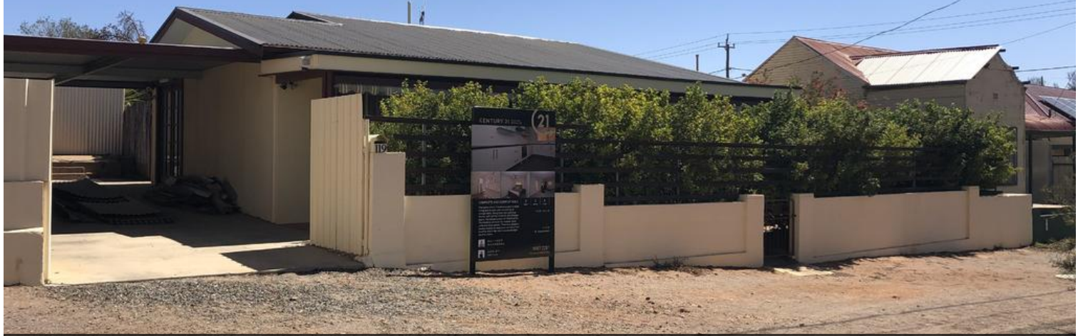
119 Garnet St, Broken Hill